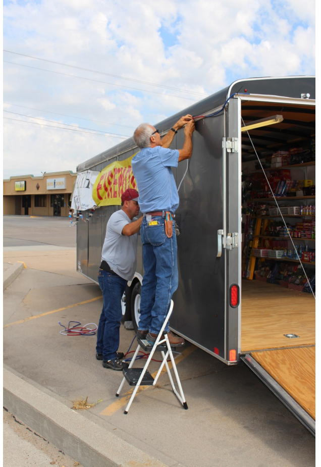
Faith Fireworks Stand (Ponderosa Mall) Proceeds support Christian Education programming